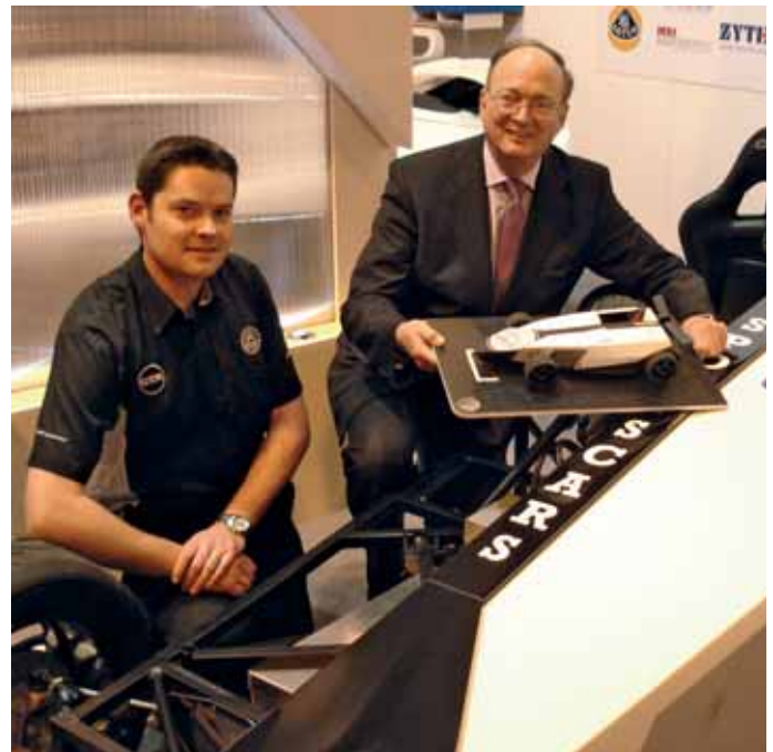
Malcolm Harbour MEP visiting Westfield Sportscars

Conservative MEP Malcolm Harbour will be chairman of the European Parliament’s powerful Internal Market Committee until 2012.