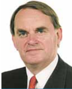
Timothy Kirkhope MEP

Timothy Kirkhope MEP, Leader of the Conservatives in the European Parliament, said: "These appointments clearly demonstrate that, although our Delegation is just 25 out of 718 MEPs, we are clearly punching above our weight. I am delighted to have been able to negotiate these posts and appoint British Conservative MEPs to them." ■