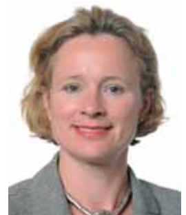
Vicky Ford MEP

Vicky Ford MEP worked in the City as an investment banker and was a Conservative councillor in Cambridgeshire. She represents the Eastern Region and has been appointed Conservative Spokesman on Economic and Monetary Affairs.