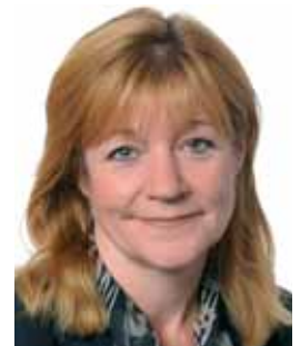
Kay Swinburne MEP

Kay Swinburne MEP has worked in both the healthcare and international finance sectors and served as a Conservative councillor in Hereford. She represents Wales and has been appointed as ECR Co-ordinator on the Economic and Monetary Affairs Committee.