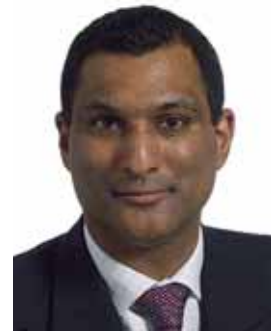
Syed Kamall MEP

South East MEP Nirj Deva is a Vice Chairman of the Development Committee, which will provide important opportunities to drive forward David Cameron’s agenda for tackling global poverty.