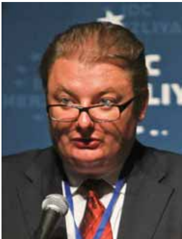
Michał Kamiński MEP

ECR Chairman, Michał Kamiński MEP, said: “President Barroso has presented an ambitious agenda for the next five years and much of it, such as his focus on completing the single market, is welcome.