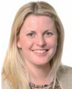
Emma McClarkin MEP

Emma McClarkin MEP is a former parliamentary assistant to Roger Helmer MEP and has