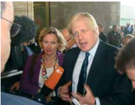
Boris Johnson talking to journalists in Brussels