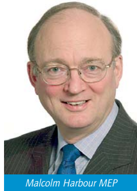
Malcolm Harbour MEP

Conservative Internal Market Spokesman Malcolm Harbour MEP is leading a team of MEPs drawing together new legislation on electronic communications that will boost competition and provide a better deal for users of mobile phones and laptops.