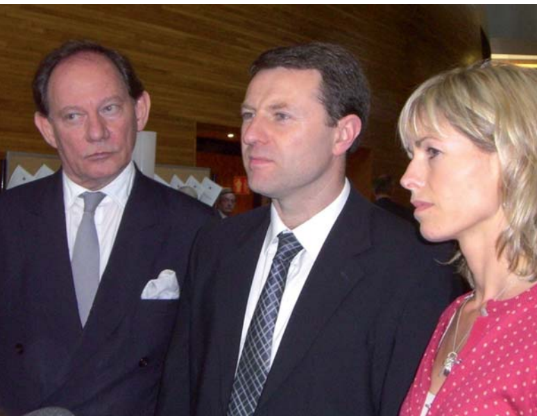
Vice-President Edward McMillan-Scott MEP campaigning with Gerry and Kate McCann for a Europe-wide missing child alert system

A majority of MEPs have signed up to a campaign initiated by Conservative Vice-President of the European Parliament Edward McMillan-Scott MEP – and supported by Gerry and Kate McCann – for a Europe-wide missing children alert system.