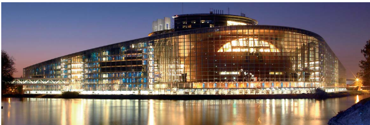
The European Parliament in Strasbourg.