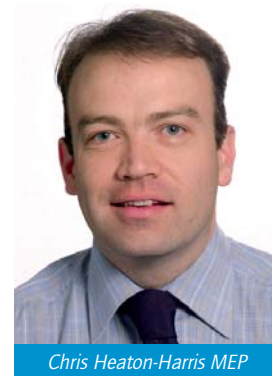
Chris Heaton-Harris MEP

Chris Heaton-Harris MEP, Chairman of the European Parliament’s cross-party Sports Intergroup, is spearheading a campaign against unnecessary EU interference in British sport. The EU has no formal power in relation to sport but the Lisbon Treaty would introduce for the first time a legal competence and law-making power for the EU in this area. Last year, the European Commission published a White Paper on Sport setting out a range of possible proposals, including new regulations and a possible ‘European police force for sport’.