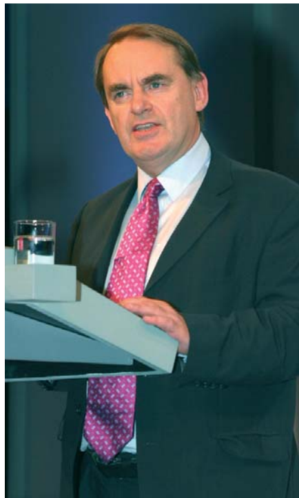
Timothy Kirkhope MEP

C heaper and fairer air fares have taken a step closer in recent months following the adoption of important legislation in the European Parliament. MEPs have approved new rules that will force airlines to include all airport taxes, fees and surcharges in the basic ticket price advertised to customers. The new law, which comes into effect at the end of the