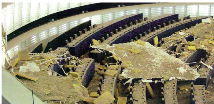
Part of the collapsed ceiling in the European Parliament in Strasbourg.

Following the collapse of the ceiling in the European Parliament in Strasbourg during August, Conservative MEPs have called on Gordon Brown to stop dithering and finally end the costly charade of the European Parliament meeting in both Brussels and Strasbourg.