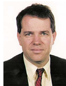
Charles Tannock MEP

Dr Tannock said: "Russia's disproportionate aggression against Georgia has overstepped the mark and unless we take a firm line with the Kremlin now, we may regret it later. The EU must not forego this opportunity to use all the diplomatic and financial tools at its disposal to assist the reconstruction efforts in Georgia, and to make the Kremlin realise that aggression towards its neighbours will be met with a united response on both sides of the Atlantic."